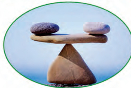
Somerset, NJ October 2-4, 2015